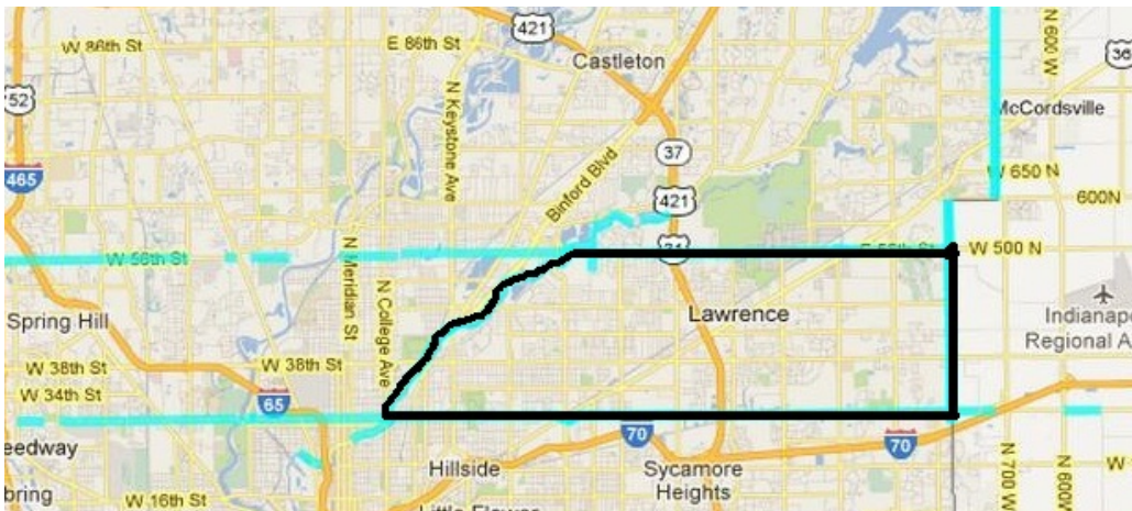
Figure 1: Map of Indy East Food Desert Boundaries

The limited access and lack of affordable and nutritious food is not only a national phenomenon, but also local one. The shortage of grocery stores seen in food deserts is also evident in the Indianapolis area, particularly in Marion County. The county is comprised of 212 census tracts, of which fifteen are identified as food deserts. According to a county study, the most prevalent food retailers are convenience stores. Additionally, 36% of residents have low-access to food and must travel more than a mile to reach the nearest supermarket. Nineteen percent of Marion County's population lives in high or extreme poverty (Elliot et al., 2011). Within the county, perhaps the most extreme local examples, there is a collection of several food desert census tracts that have identified itself as the Indy East Food Desert (IEFD). It is the object of this study. The IEFD is marked by the boundaries of 56th Street to the north, 30th Street to the south, Carroll Road to the east, and Fall Creek Parkway Drive to the west, seen in figure 1.